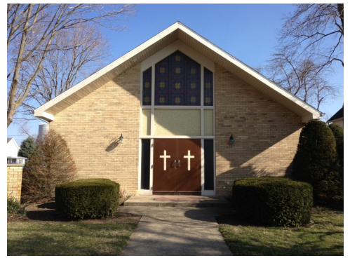
Our Lady of Lourdes Catholic Church